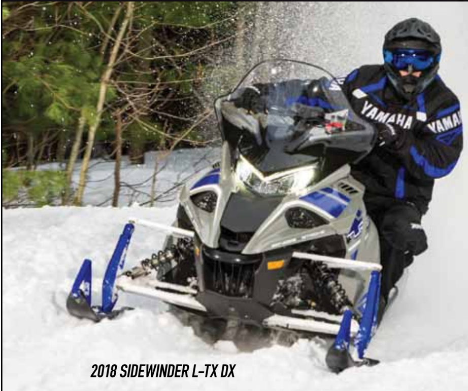
2018 SIDEWINDER L-TX DX