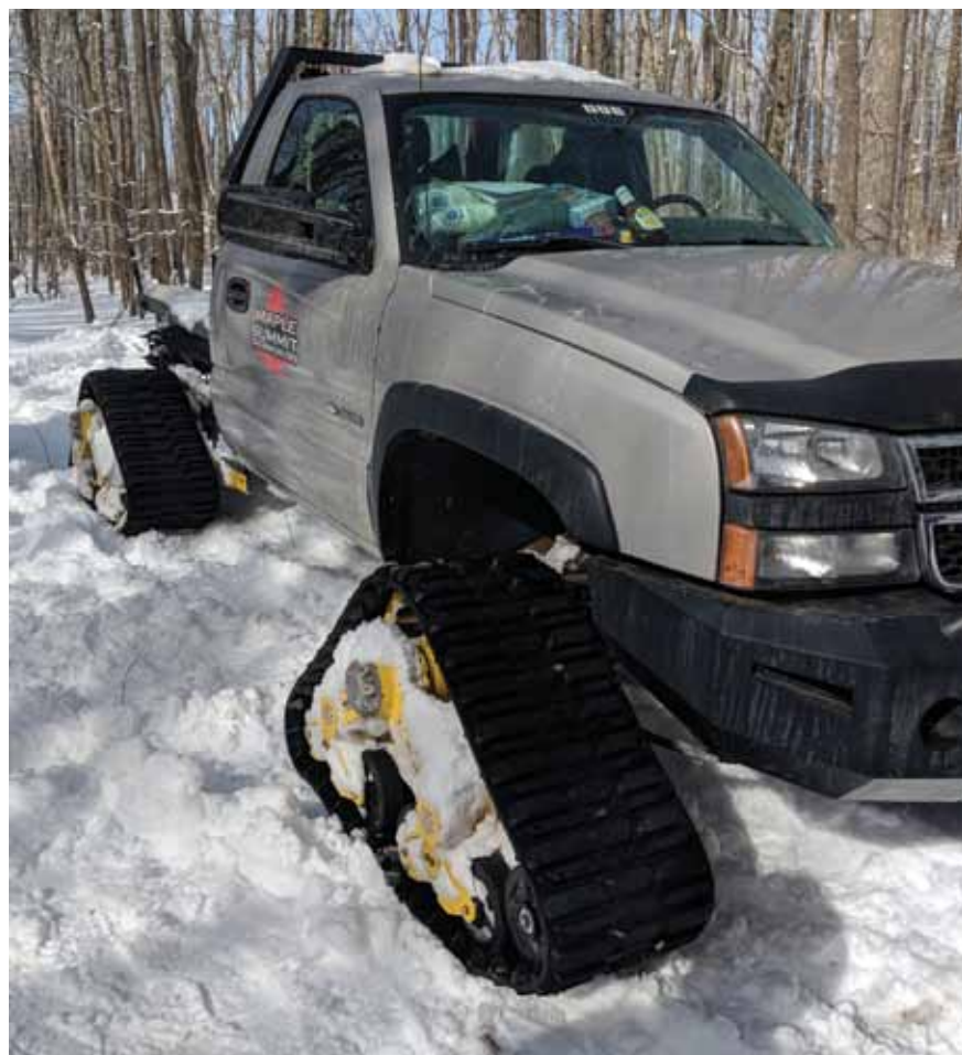
Below: Tracked truck for grooming.