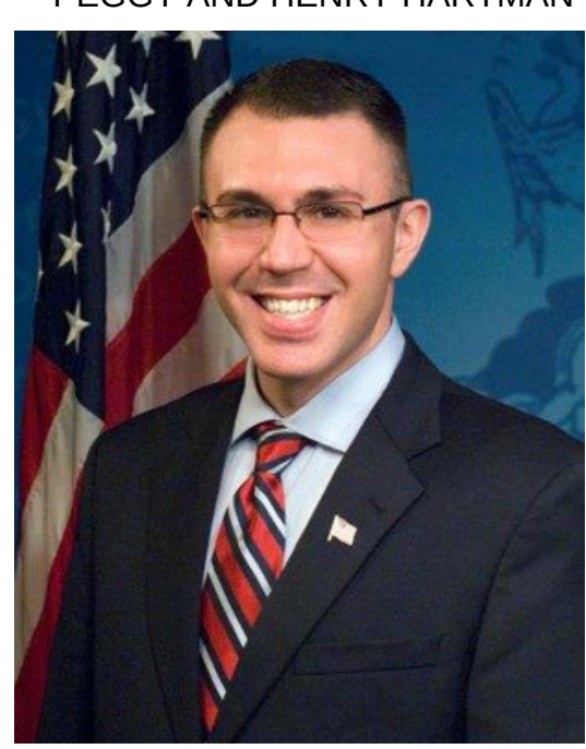
PSSA GOVERNMENT OFFICIAL OF THE YEAR THE HONORABLE RYAN BIZZARRO