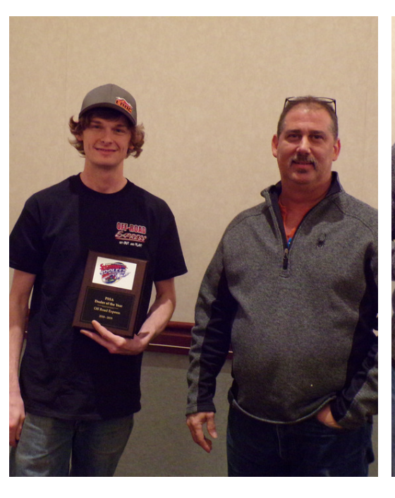
PSSA DEALER OF THE YEAR OFF ROAD EXPRESS