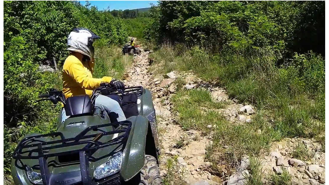
Anthracite Area Outdoor Adventure Area