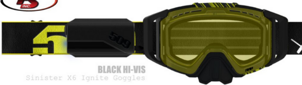
BLACK HI-VIS Sinister X6 Ignite Goggles