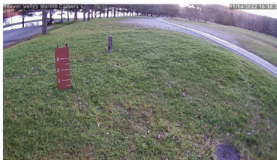
Prince Gallitzin State Park Beaver Valley Marina Snowmobile Parking Lot