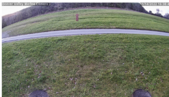
Prince Gallitzin State Park Beaver Valley Marina Snowmobile Trail