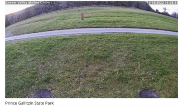
Beaver Valley Marina Snowmobile Tr