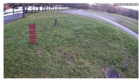
Prince Gallitzin State Park Beaver Valley Marina Snowmobile Parking Lot