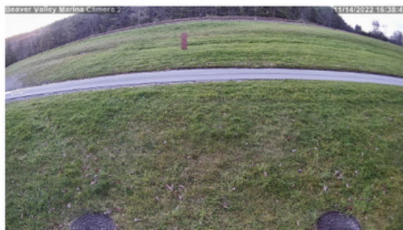
Prince Gallitzin State Park Beaver Valley Marina Snowmobile Trail