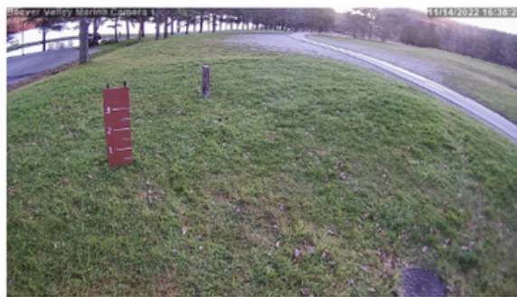
Prince Gallitzin State Park Beaver Valley Marina Snowmobile Parking Lot