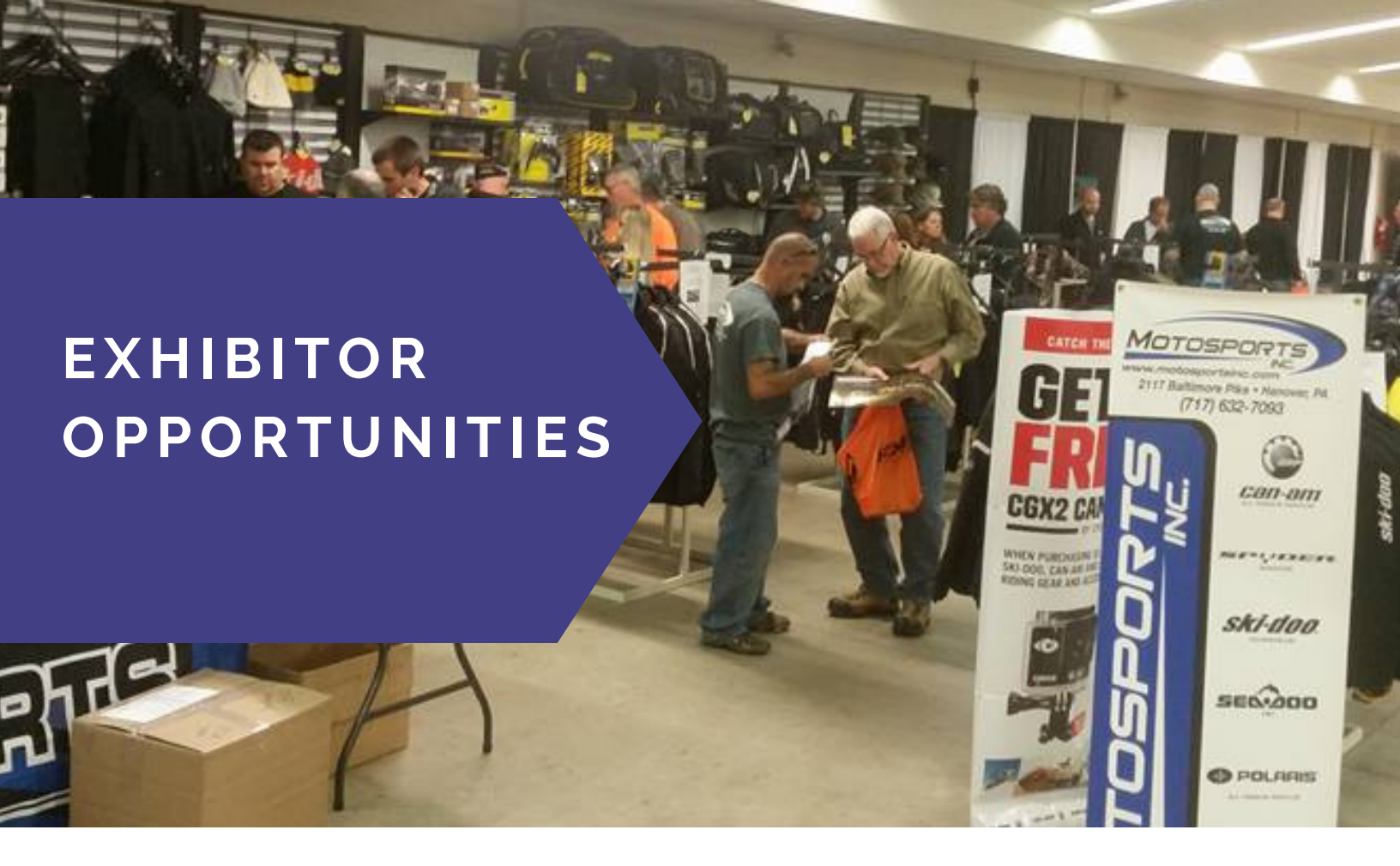
EXHIBIT SPACE INCLUDES: