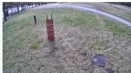
Prince Gallitzin State Park Beaver Valley Marina Snowmobile Parking Lot