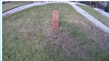
Prince Gallitzin State Park Beaver Valley Marina Snowmobile Trail