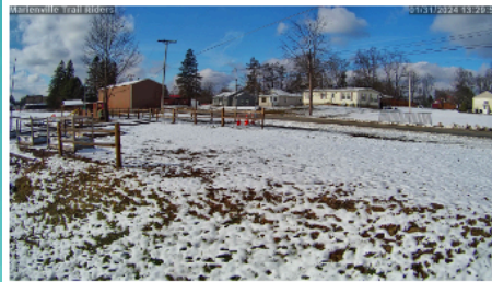
Marienville Trail Riders Snowmobile Club