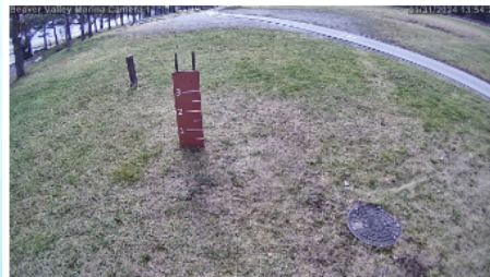
Prince Gallitzin State Park Beaver Valley Marina Snowmobile Parking Lot