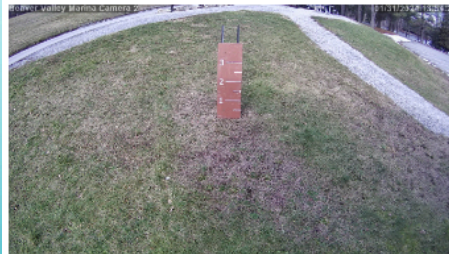
Prince Gallitzin State Park Beaver Valley Marina Snowmobile Trail