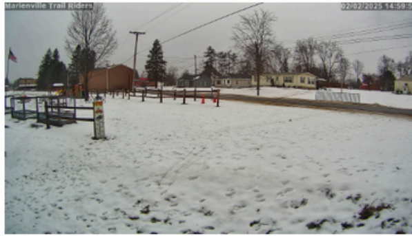
Marienville Trail Riders Snowmobile Club